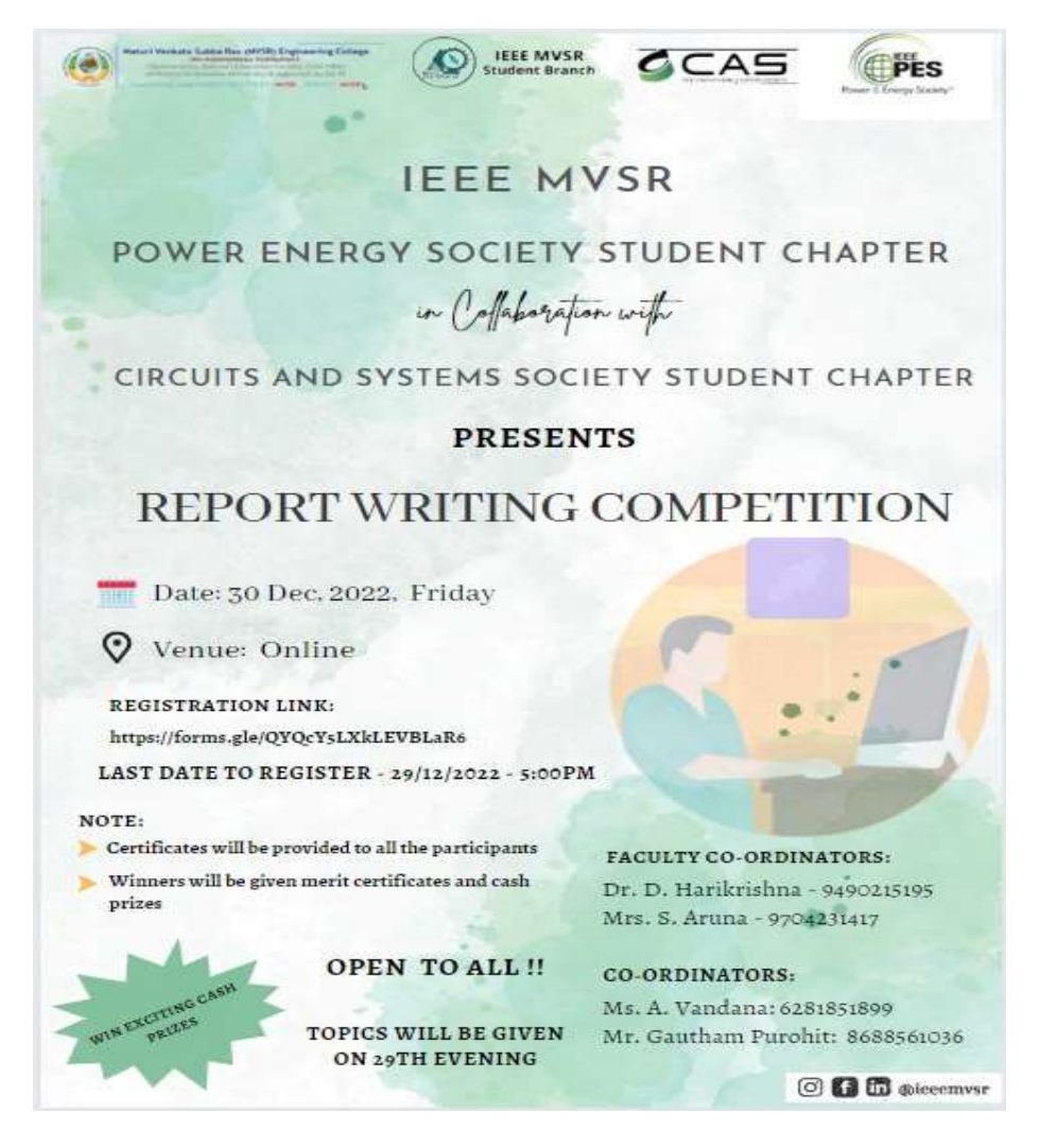
Flyer for the Event

Session Details: Date: 30 December, 2022 Timings: 9:30 am-11:30 am Number of Attendees: 40